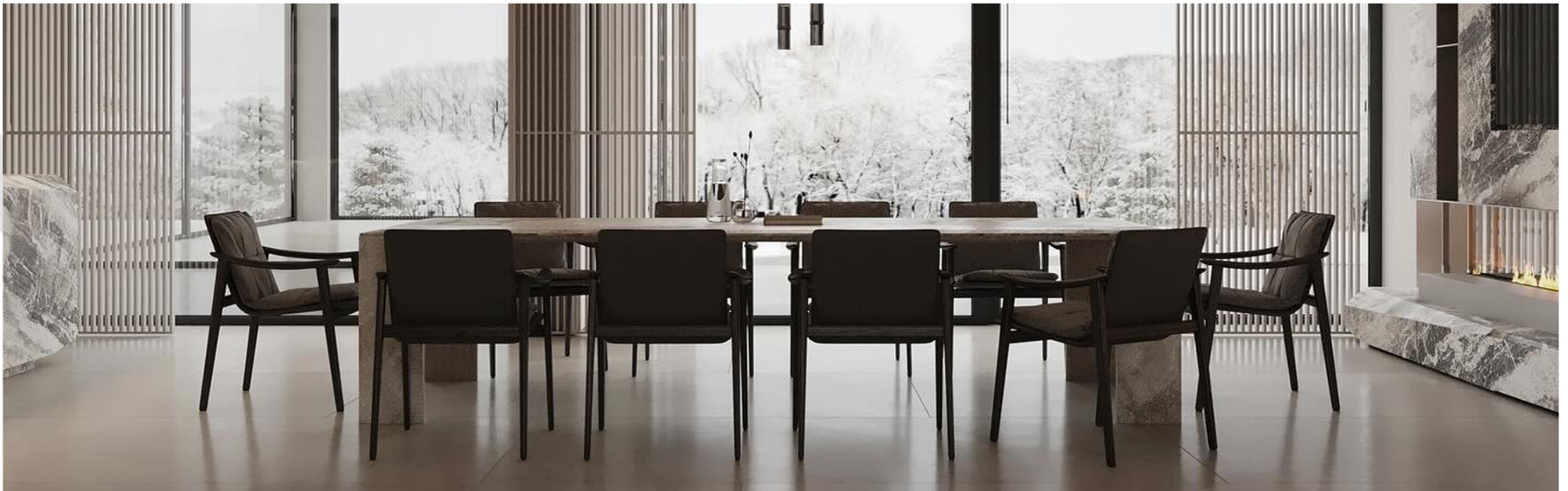
REFERENCE FOR INTERIOR CONCEPT