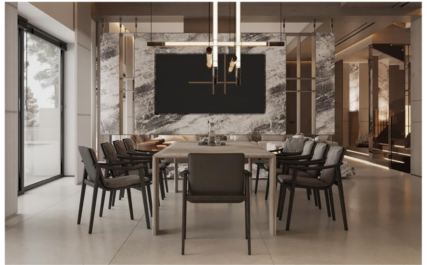
REFERENCE FOR INTERIOR CONCEPT