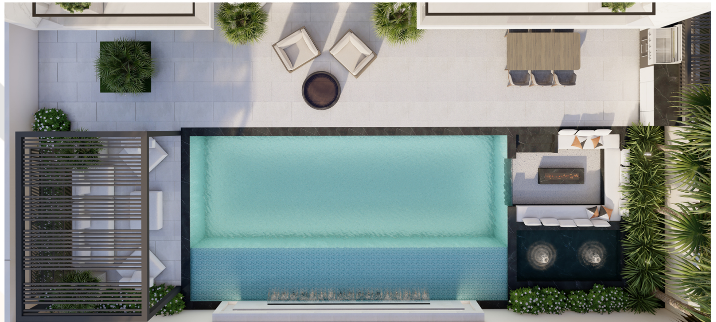
POOL AREA TOP VIEW

Flanking the dining area, additional seating beckons, offering a place to lounge and soak in the serene surroundings. Whether you're basking in the sun's warm embrace during the day or stargazing in the evening, these outdoor spaces provide the perfect setting for relaxation and rejuvenation.