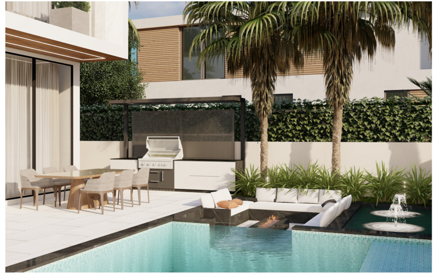
SUNKEN FIRE PLACE

Imagine stepping out of the elegant living spaces of our villa project in Dubai and being greeted by a pool area that epitomizes luxury and comfort. As you gaze upon this