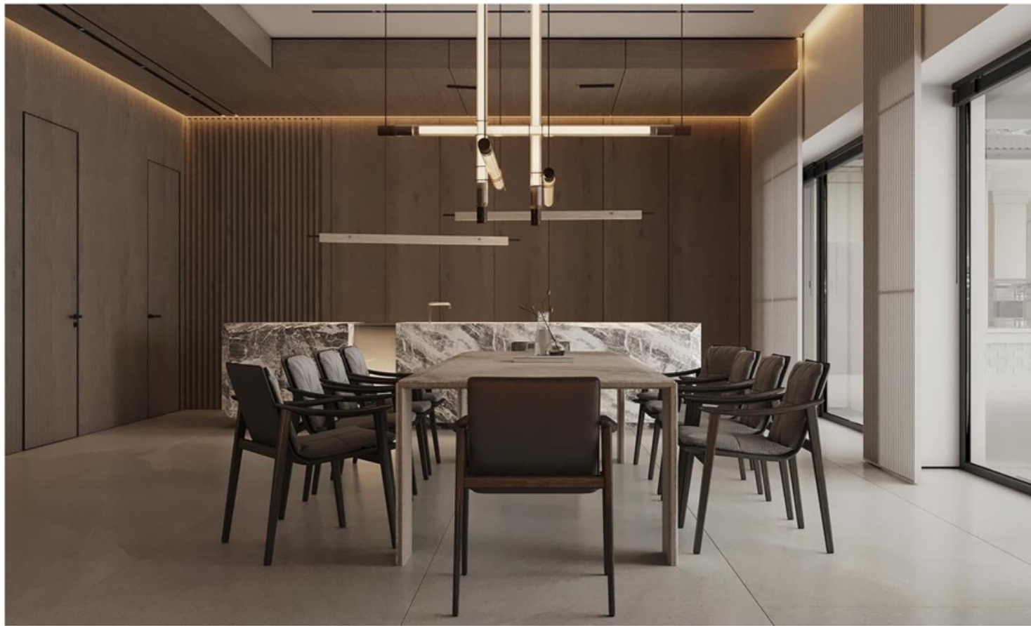
REFERENCE FOR INTERIOR CONCEPT