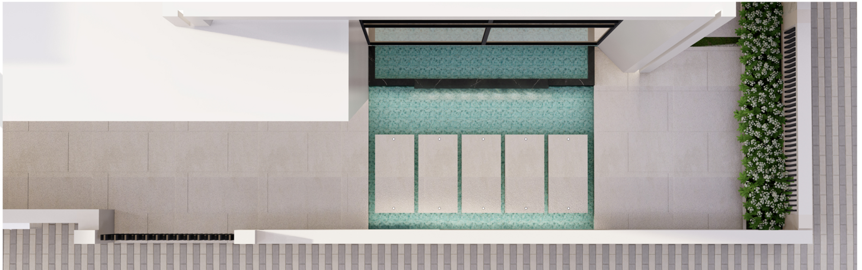
ENTRANCE TOP VIEW