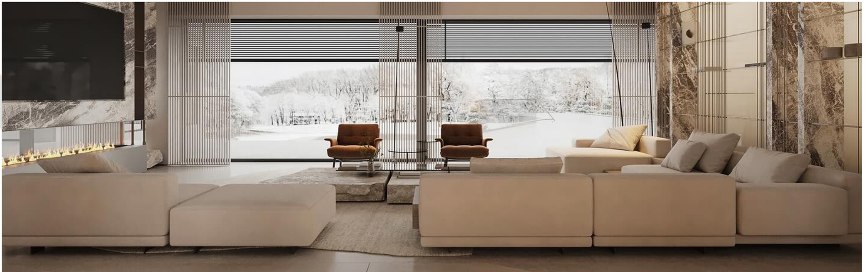
REFERENCE FOR INTERIOR CONCEPT

The interior concept of our villa project in Dubai embraces a color palette inspired by the timeless beauty of the desert landscape, with shades of ivory and desert sand weaving together to create a serene and sophisticated ambiance. As you step into the villa, you are greeted by an atmosphere of understated elegance and warmth. The walls are adorned in hues of ivory, evoking a sense of purity and tranquility, while accents of desert sand add depth and texture to the space