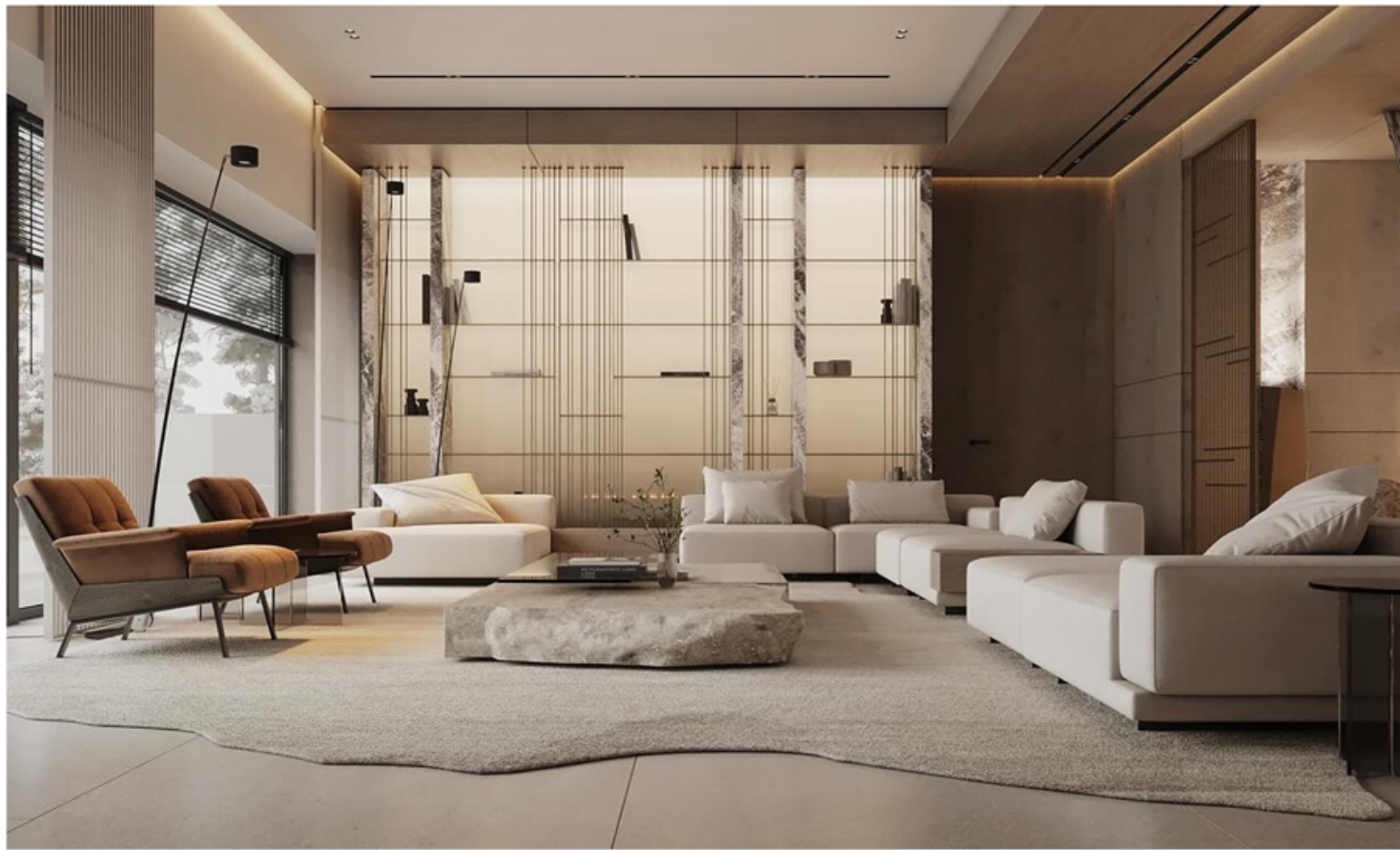
REFERENCE FOR INTERIOR CONCEPT