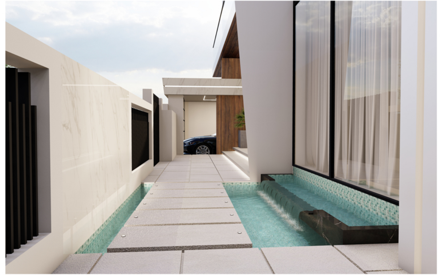
ENTRANCE WATER FEATURE