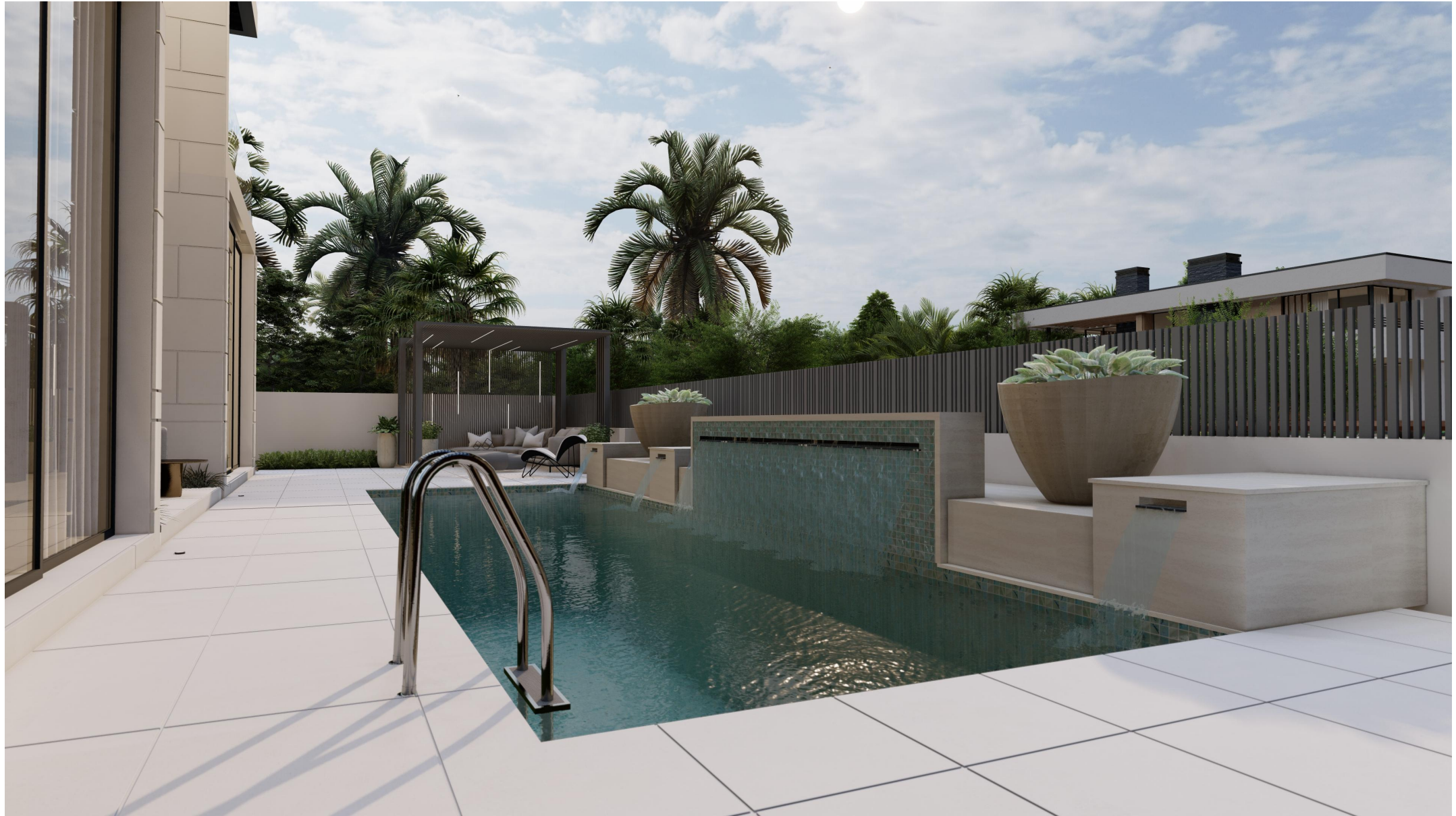
SWIMMING POOL AREA