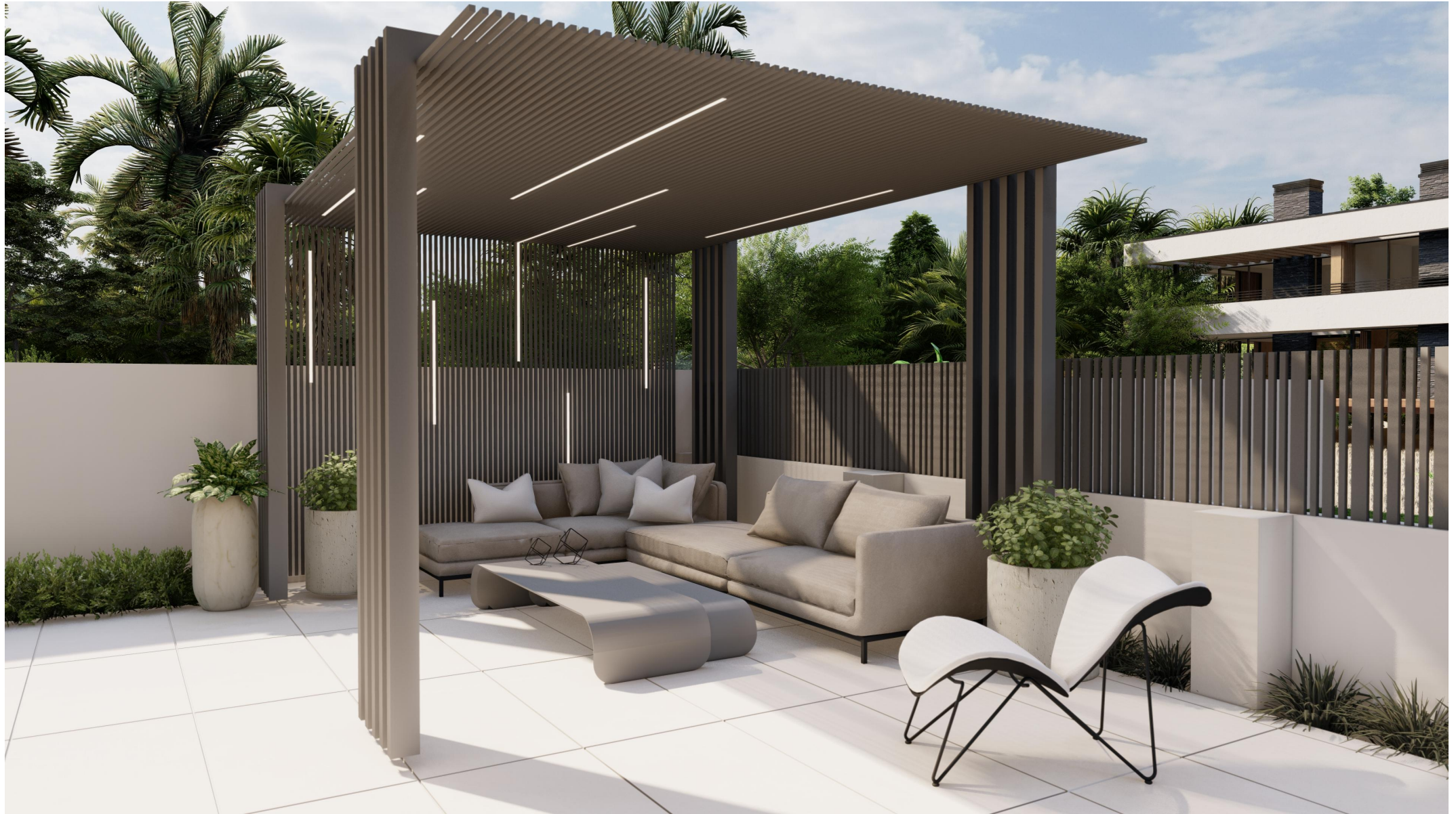
OUTDOOR SITTING AREA